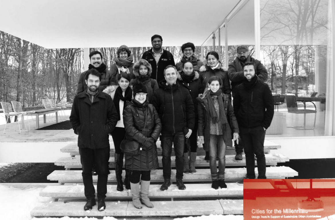
Group of participants visiting the Farnsworth House, by Mies van der Rohe in Plano, Illinois.