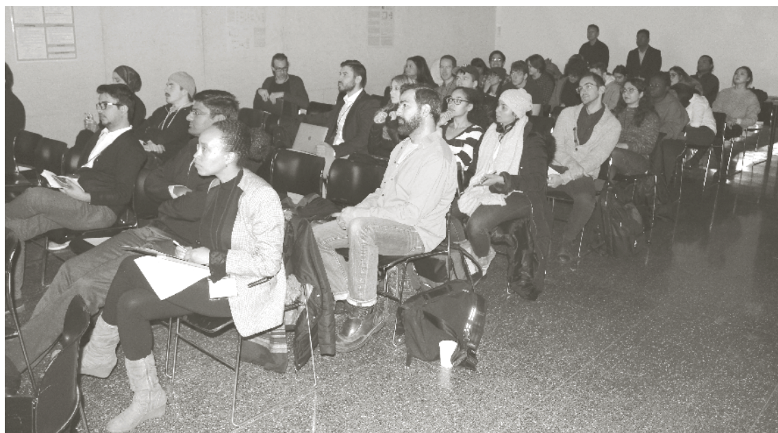
Symposium participants during one of the paper sessions in the lower core, at S. R. Crown Hall.