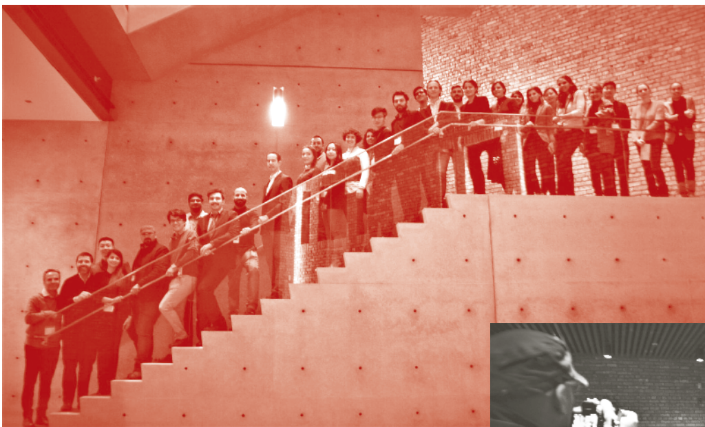
Reception and dinner at Tadao Ando Gallery, Wrightwood 659.

November 16–18, 2018 S. R. Crown Hall, IIT Campus, Chicago, IL